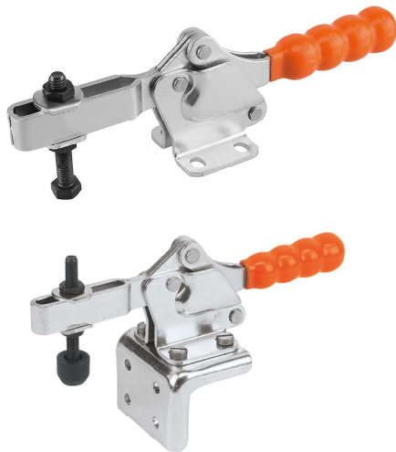
Angle bracket for front face mounting (see accessories)