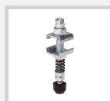
Spring loaded screw No. 6892