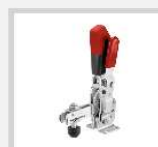
Vertical toggle clamp with red handle and safety latch