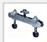
Supporting arm for toggle clamps No. 6895