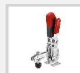
Vertical toggle clamp with red handle and safety latch