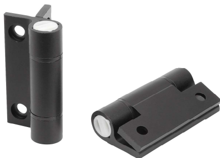
Hinges with closing spring