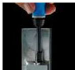
Countersink NG-3 Handle, C-Holder $71.25 NG3100 C20 Countersink