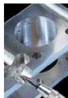
Adjustable Scraper 12mm Anodized Handle $55.60 SC8000 T80 scraper blade