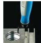
"O" Ring Burr NG-1 Handle, OR Blade $48.15 NG1100