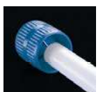
Metal Reamer Deburr both inside and outside $21.00 PD1000M edges of tube. Die cast body with 3 cutters. Reamer for aluminium, brass and copper tubing. Range 4 - 42mm