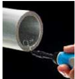
Super Burr NG-3 Handle, S Holder $40.50 NG3003 S20, S30, & S100 blades