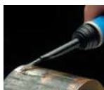
Mini-Scraper NG-3 Handle, D-Holder $41.00 NG3700 D50 triangular miniscraper