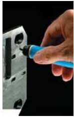
Noga Burr 3 NogaGrip Handle $29.00 NG1003 S10, S20, & S35 blades