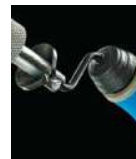
External RotoDrive NG-1 Handle $61.00 NG1700 Range 4 - 18mm