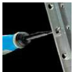
Internal Scraper NG-3 Handle, D-Holder $38.00 NG3710 D66 internal scraper