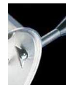
Reversible Mini Countersink $63.00 RC1000 Range 3 - 5.5mm