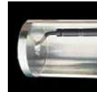
Liza Burr UH1000 Handle, SN Holder $38.00 LB1000 N1, N2, & S10 blades