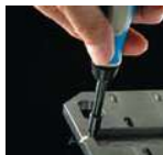
Tele Burr NG-3 Handle, N Holder $34.00 NG3002 N1, & N2 blades