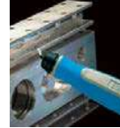
Magic Burr 2 NG-2 Handle, N1 & N2 blades $27.00 NG2002